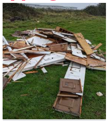
Massive fly tipping of household furniture on land behind the Food Works SW