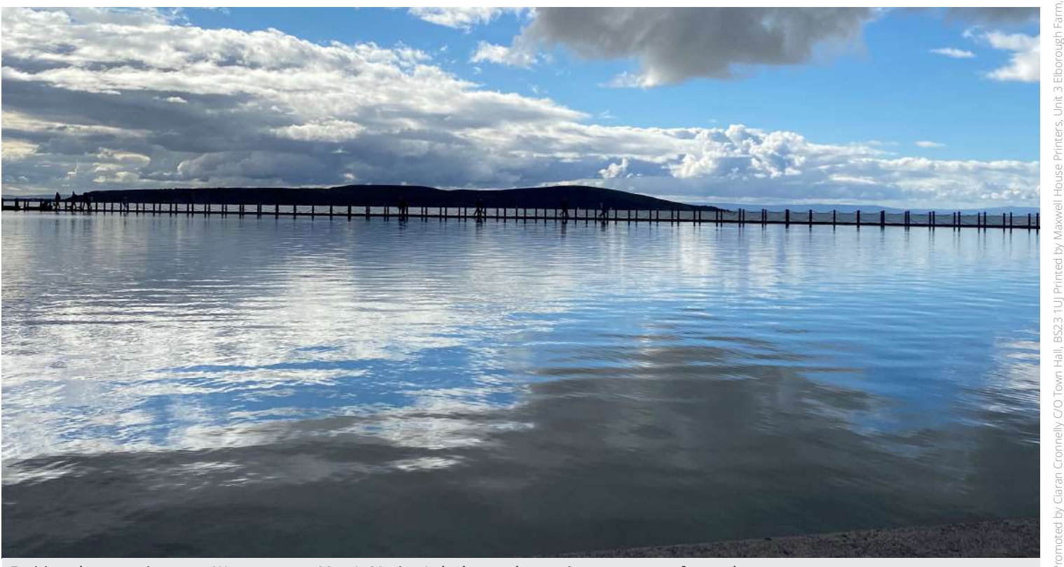
Exciting plans to rejuvenate Weston-super-Mare's Marine Lake have taken an important step forward.

Marine Lake has been unsuitable for swimming for years due to the build up of mud and silt having been ignored by previous politicians running the council, but finally it's getting a £300k clean!