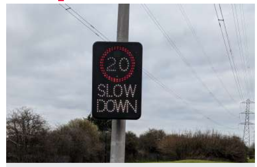
Temporary vehicle activated speed sign installed at the Maltlands earlier this year

For some time I've been trying to secure a permanent vehicle activated speed sign to remind drivers of the speed limit and recently I've had some success, as the council agreed to loan me a sign for 1 month, which I placed at the Maltlands.