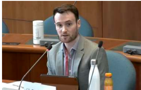
Picture of me chairing the last Health Overview and Scrutiny Panel in April 2022

"Let me know your experiences - whether good or bad - about using local dental services"