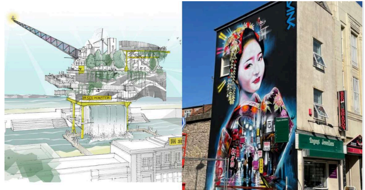
Artist impression of SEE MONSTER (credit: North Somerset Council) / One of the walls from last years Upfest. (Credit: Culture Weston)

There's some exciting events coming to Weston over the summer!