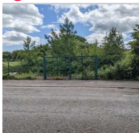
Picture of the empty site at the Maltlands, which is now overgrown

If you have any ideas please email or call me.