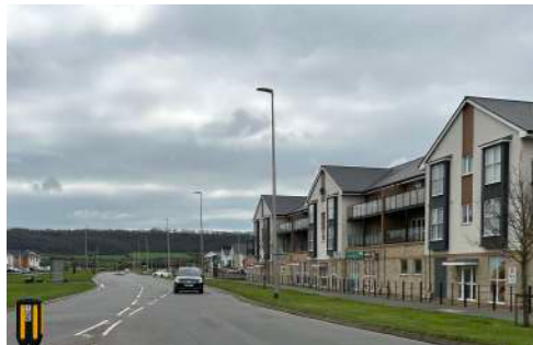
Your Labour candidates want to see residential street lights turned-on after midnight in key crime areas

ANTISOCIAL behaviour is the most common complaint received by your Labour councillors which is why it's an issue we have consistently pushed the council and police to deal with.