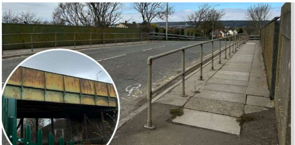
Winterstoke bridge is one of the busiest roads in Weston.

"As your local candidates with local knowledge we understand the misery that this bridge closure will cause if not done right."