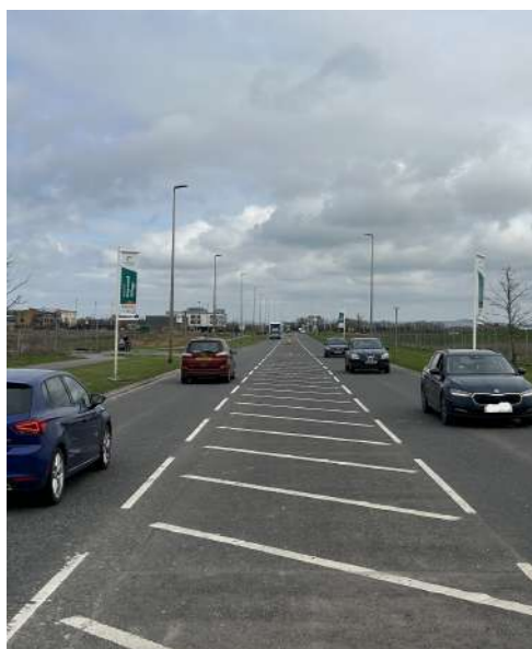
New school is due to be built 2024/25 so there's plenty of time to make improvements to road safety

CHILDREN'S safety will be put at risk when crossing The Runway if no road safety improvements are made when the new primary school is built.