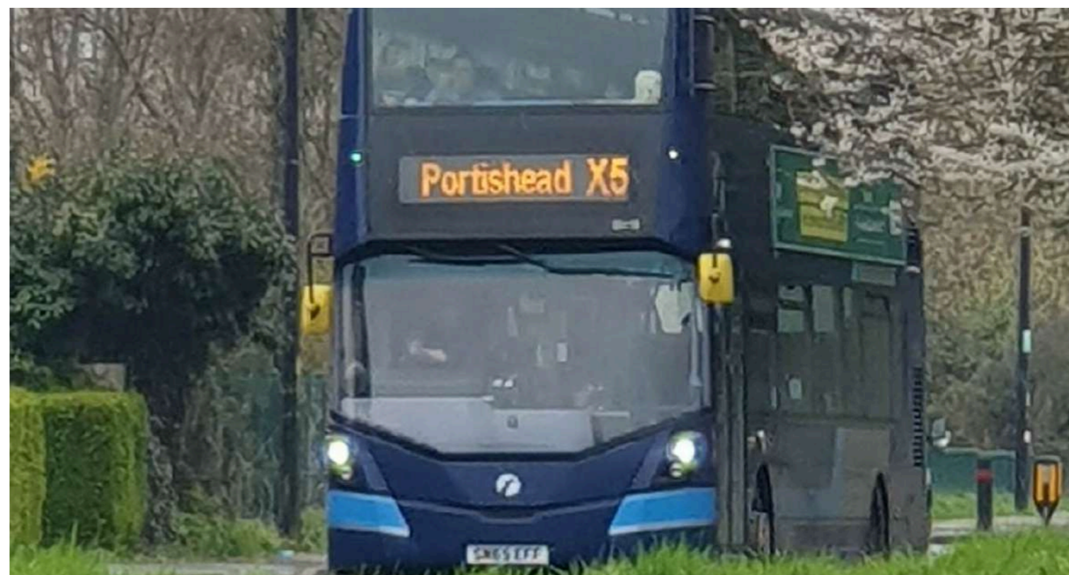
Labour has got the vital X5 bus service reinstated throughout Locking Castle and Weston Village

The vital X5 bus route through Locking Castle and Weston Village has been reinstated following Labour's long campaign led by Ciaran Cronnelly.