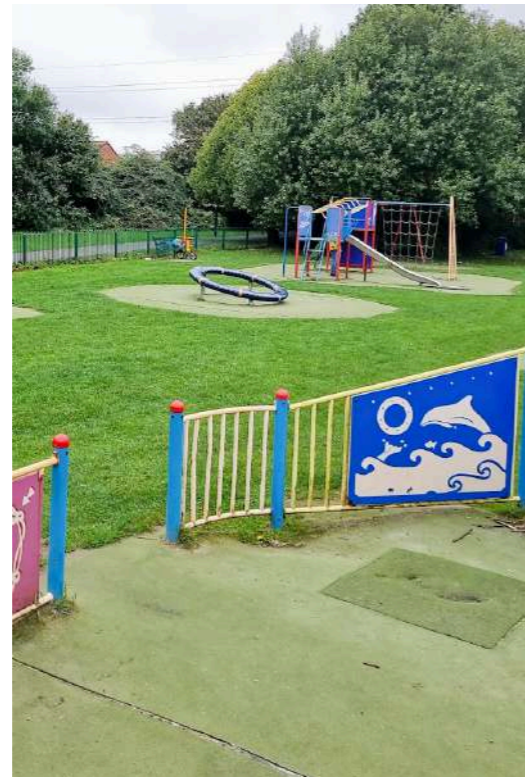
Weston Town Council will be improving the play areas over the next few months

Our improvements will begin with general maintenance such as soil