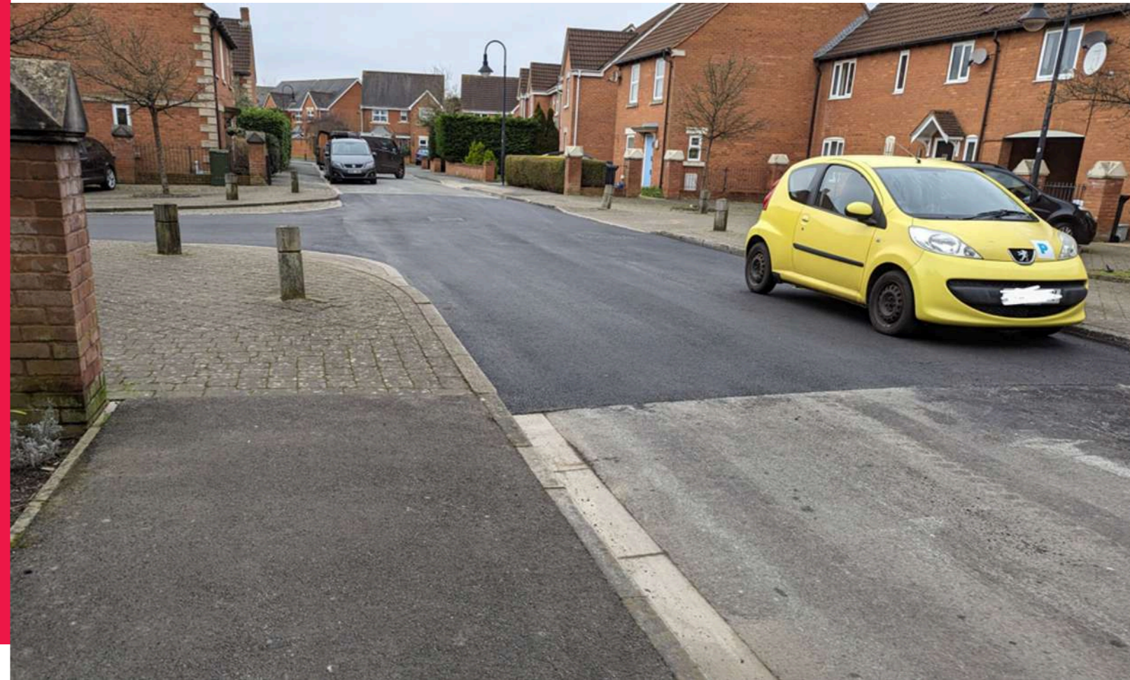
Picture of one of the newly resurfaced roads at Bransby Way outside Carberry View

AFTER our persistent lobbying and a lengthy campaign, we're thrilled to report successful resurfacing of some pothole ridden roads in Weston Village. Notably, part of Worle Moor Road, Bransby Way, and two sections of Longridge Way have seen block paving replaced with asphalt, a significant step toward fulfilling our election pledge.