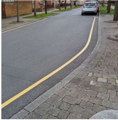
Picture of new yellow lines installed along the X5 bus route throughout Weston Village

Yellow lines have now been painted between Aspen Park Road and Shrewsbury Bow.