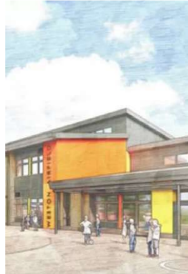
Image by Persimmon Homes Severn Valley of what the new Haywood Village primary school could look like

HAYWOOD Village could soon have a new 630-place primary school with nursery, community hall and MUGA. Persimmon Homes have submitted a planning application for a new school to be built near the Runway in 2025.