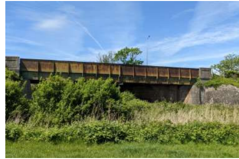
Picture of Winterstoke Bridge which is due to be replaced within the next few years

ONE of our campaign promises last year was to ensure Haywood Village did not face traffic misery when the bridge in Winterstoke Road was replaced – we're still working on it!